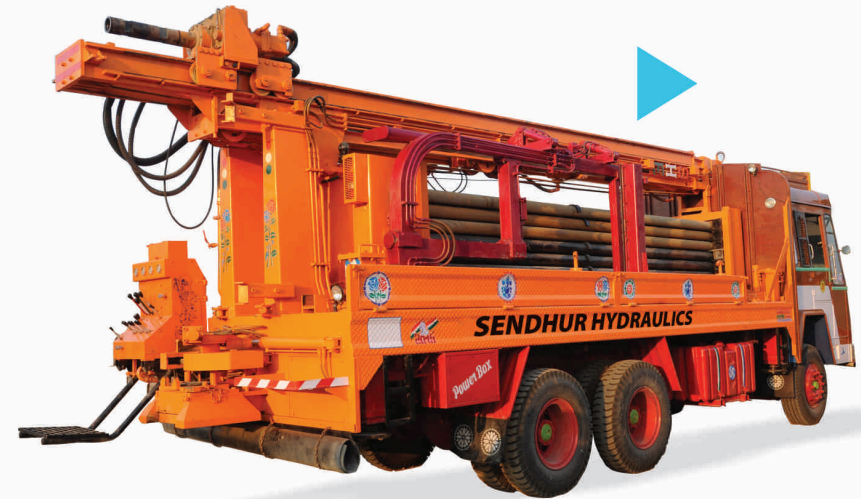
MODEL : AXL - A+