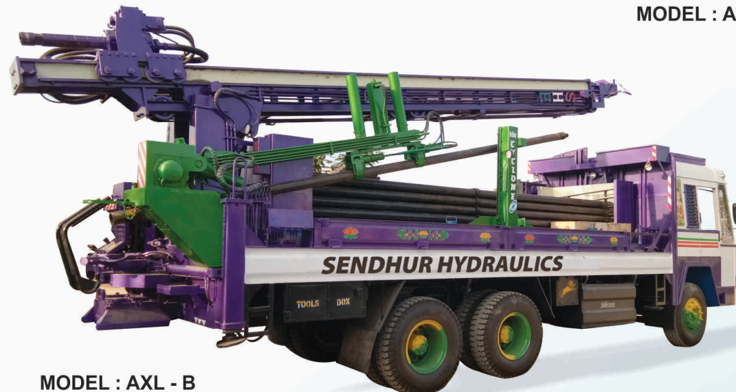
MODEL : AXL - B