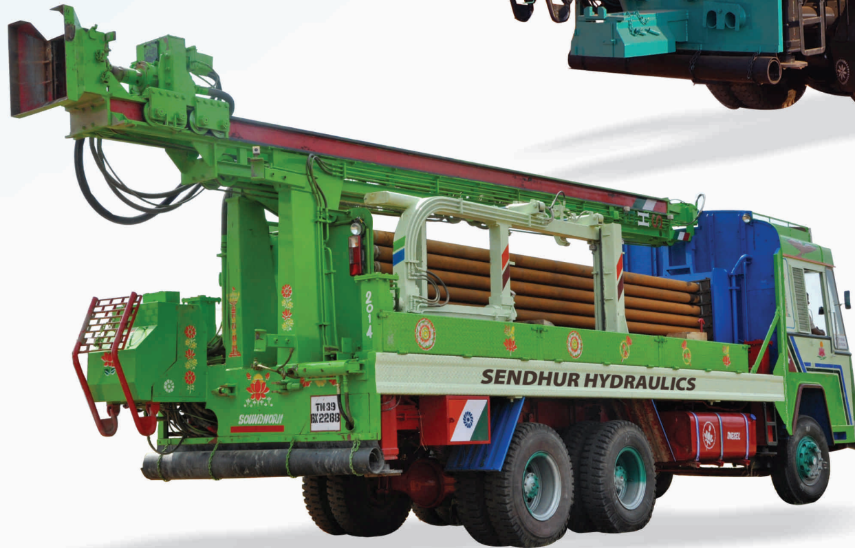
MODEL : AXL - A