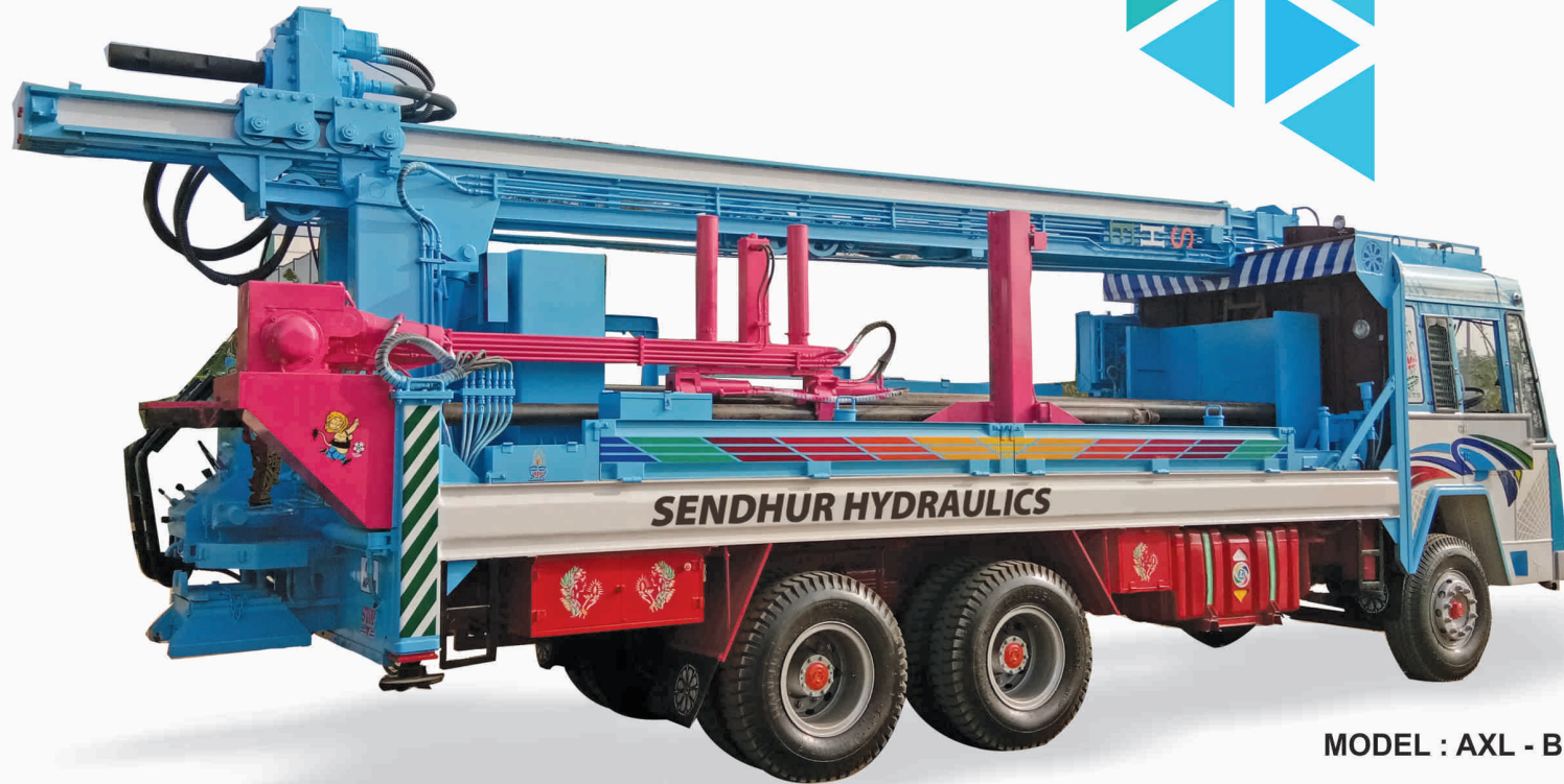
MODEL : AXL - B